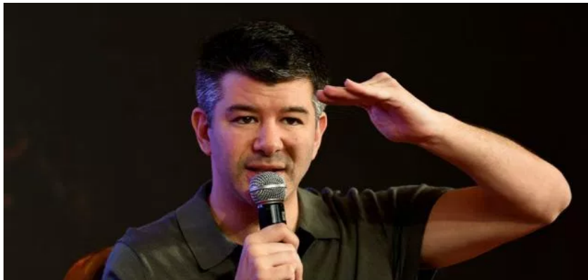
Co-founder and Chief Executive Officer (CEO) of US transportation company Uber Travis Kalanick gestures as he speaks at an event in New Delhi on December 16, 2016.

Filed Under: Boycott , President Donald Trump , Travis Kalanick , Uber , Uber CEO