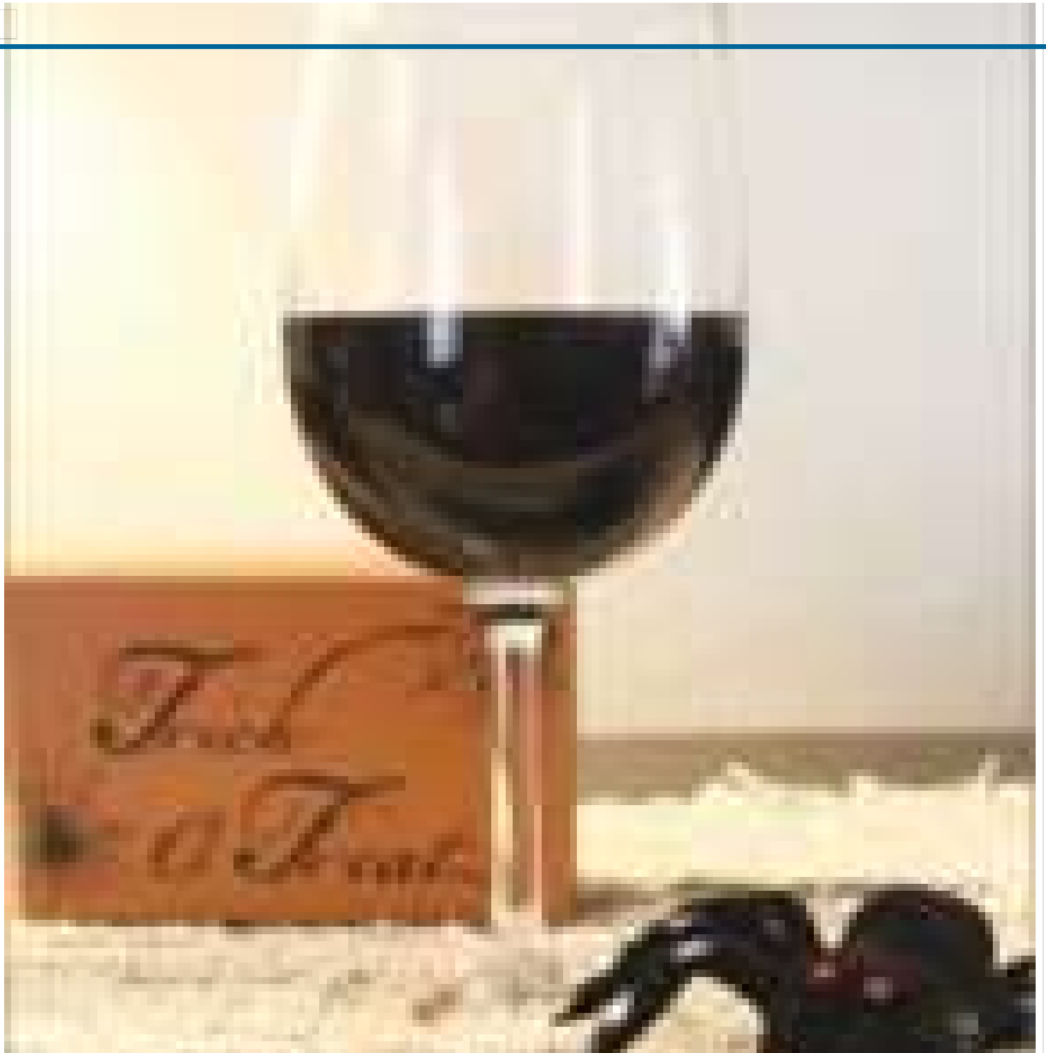
No tricks, just treats for Halloween wines