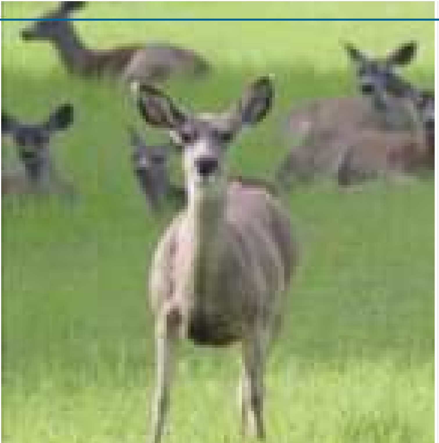
How to steer clear of deer on the road